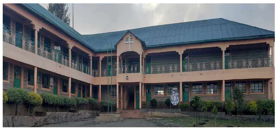
Assumption High School (Kenya)

The Lay-Religious Alliance in East Africa began as a group of «friends of the Assumption». They have grown into a solid group of lay members with an impressive structure and organization. The first group made promises/ commitments in 2015 in Kenya. Over the past three years, there has been a real revival of vitality within the groups.